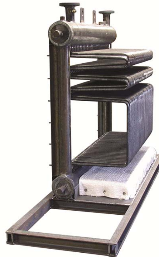
HE-RV On Left With Extended Heating Surface