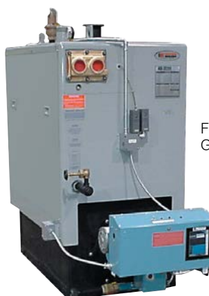
Forced Draft Gas Fired CLM-Series

Storage tanks and water heaters comply with the recommendations of ASHRAE 90-75.