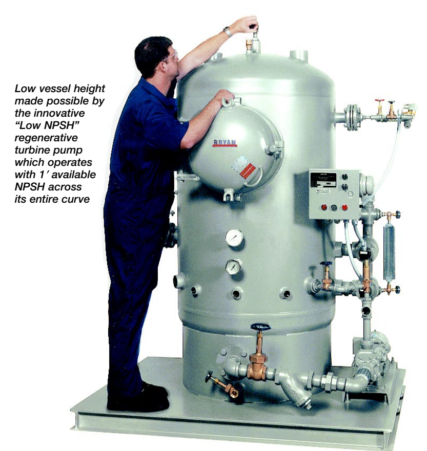
5,000 PPH unit shown