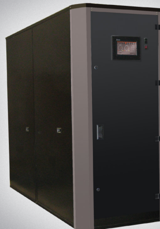
Free Flex Series 1000-6000 MBH