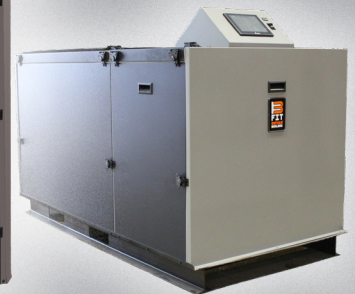
BFIT Series 1000-4000 MBH